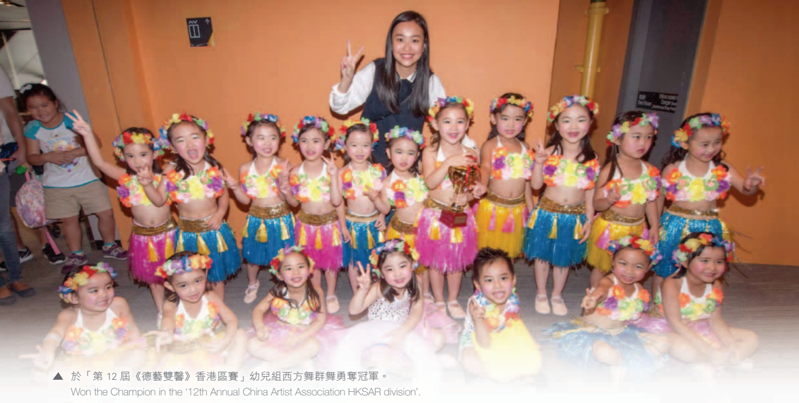
▲ 於「第 12 屆《德藝雙馨》香港區賽」幼兒組西方舞群舞勇奪冠軍。 Won the Champion in the '12th Annual China Artist Association HKSAR division'.