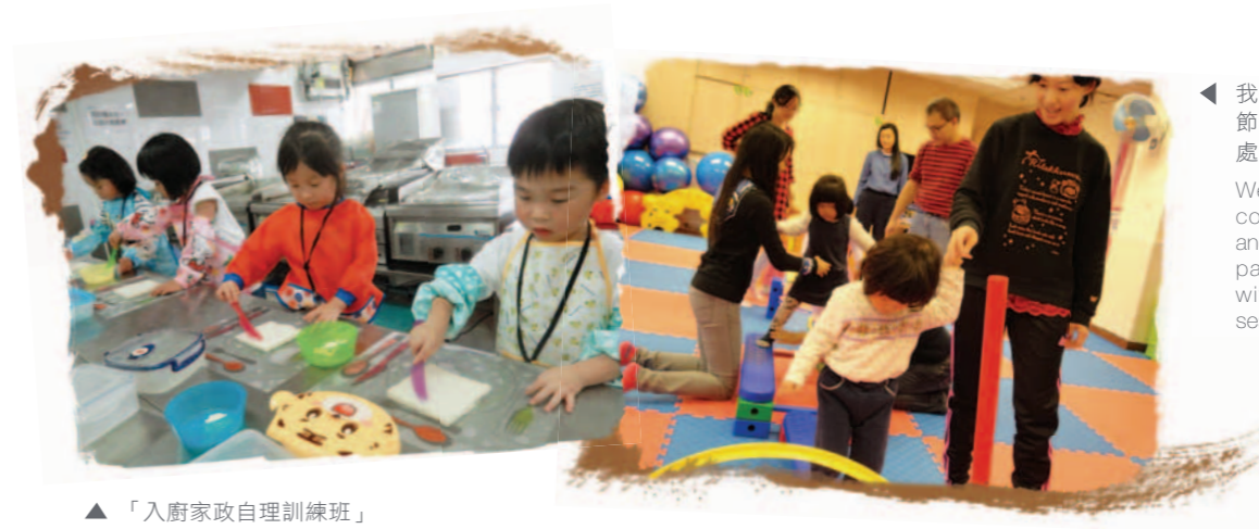
▲ 「入廚家政自理訓練班」 'Self-discipline Training for Kids in Kitchen'

Dancing is one of the key development projects of Jackie Chan Whole Person Development Centre. Outstanding accomplishment has achieved in 2015, where the students went on the stage with other outstanding dancers and was invited to perform at the 'Standard Chartered Arts in the Park Mardi Gras 2015'. They had also won the Champion in the '12th Annual China Artist Association HKSAR division' and the '8th Let's Dance in HK' of Hong Kong International Exchange of Artist & Culture Association.